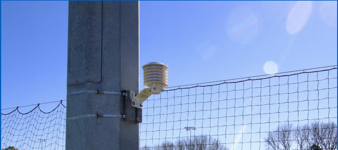
A temperature and humidity monitoring device featuring a Stevenson shield.

Internal and ambient readings are not the same. It is important that you recognise this, and correctly label your telemetry for these readings in your data schema.