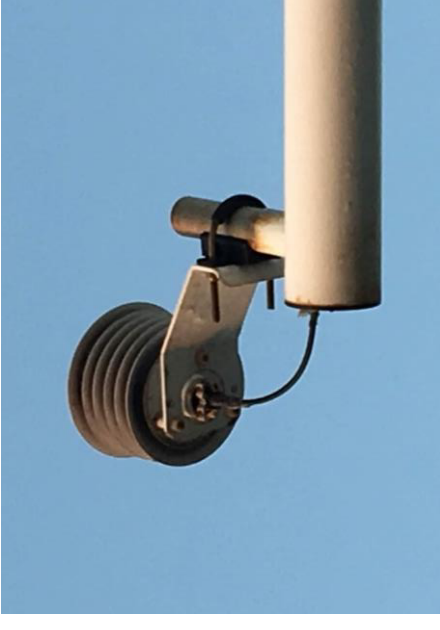
A temperature and humidity sensing device deployed on an ocean pier, suffering from rust corrosion.

If you know that your device will be subject to such conditions, choose materials that are resistant to salt corrosion. This consideration must extend to all mounting brackets, components, and fixings.