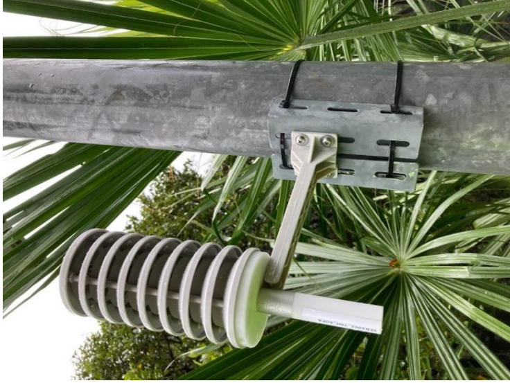
A temperature sensing device fitted with a solar radiation shield.

A solar radiation shield (shown in the image to the left), or Stevenson screen, is a special kind of housing designed for meteorological sensors. It prevents direct thermal radiation from the sun from heating up the sensor or surrounding components, while enabling the highest possible airflow around the sensor, from all directions. A shield should be white or light in colour, maximising reflectivity of infrared. It should also be lightweight, and devoid of thermal mass. Traditional shields are rectangular in profile, but a lot of smart sensing devices employ a cylindrical design.